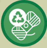
Recycled Yarn Fabric

Eco inside, cozy outside, that's the balance.