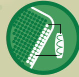
Pocketed Edge Coils

With Pocketed Coil® springs providing unsurpassed motion separation, conformability, and durability, you're in for the sleep of your life.