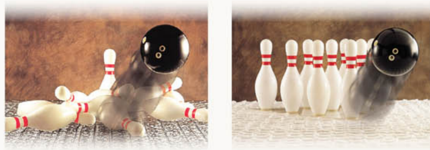
Non Simmons Coil Original Simmons® Pocketed Coil®

At the core of each Simmons® BackCare® Advanced™ Recharge® mattress is the renowned Simmons® Pocketed Coil® system. Each high-tensile steel coil is engineered into a barrel shape and pre-compressed to achieve additional resilience and greater spring effect. Individually wrapped with shrink- and tear-resistant, quick-dry Pockets, the coils are bonded in the middle using NASA Space Shuttle glue to allow independent movement with no friction and sound. This unique system delivers unsurpassed support, maximum conformability and minimum motion transfer, giving you undisturbed quality sleep while caring for the back.